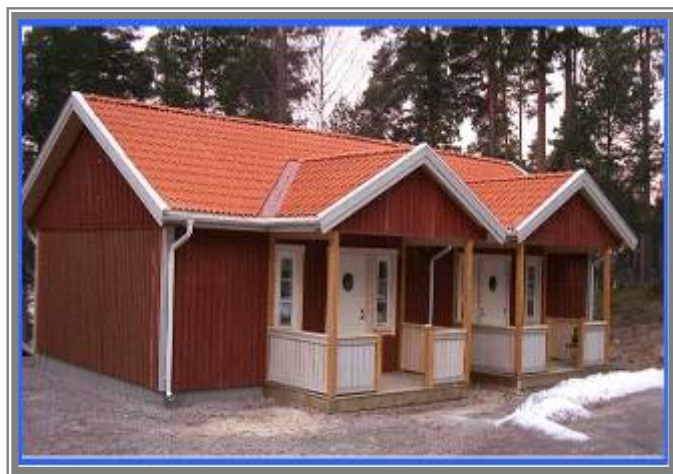
Family housing 2-6 people/house